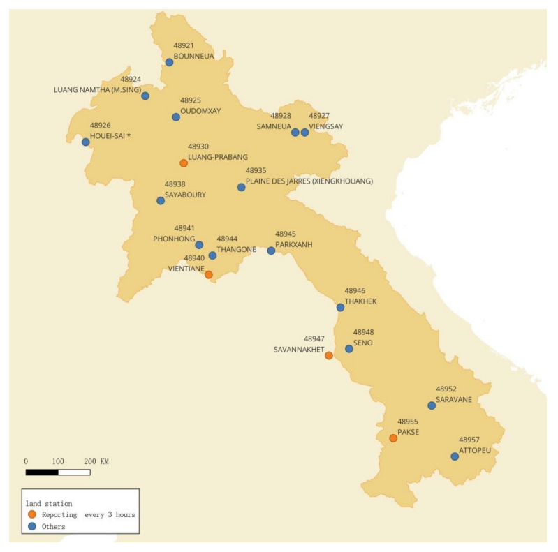
Figure 2. The distribution of Laos surface stations exchanging data by GTS. The Orange dots correspond to those stations that provide all day round information in intervals of three hours (with a delay of 1 to 2 hours). The blue dots are those stations that do transmit to GTS but only during daytime and in different intervals.