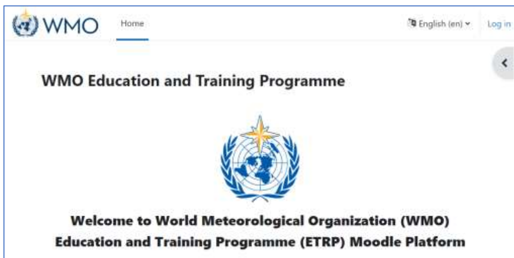
Image 1. WMO ETR Moodle homepage